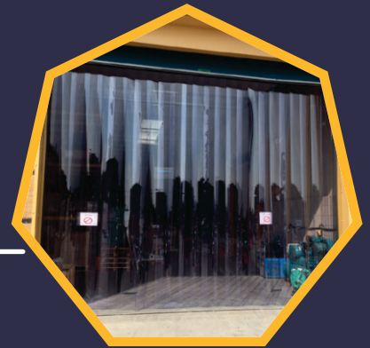
Strip Curtain and LOTO