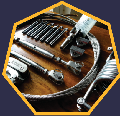
Permanent Anchorage Life Lines for horizontal and vertical work at height