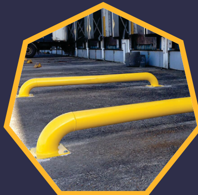
Tubular Wheel Guide