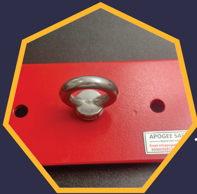
Wide range of Anchors for work at heights