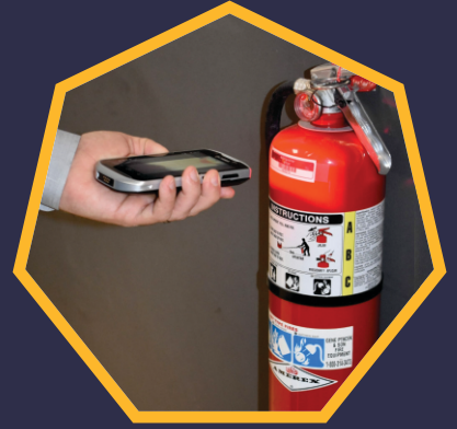
Assets Integrity Management System