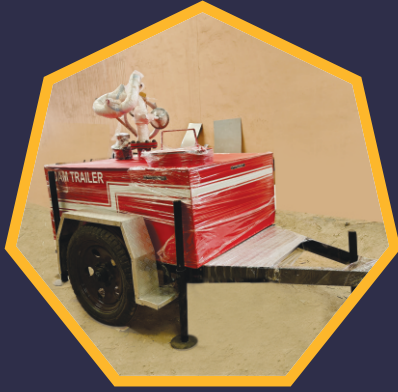
Foam Tank customized trailers complete fire related supply and AMC/CAMC services